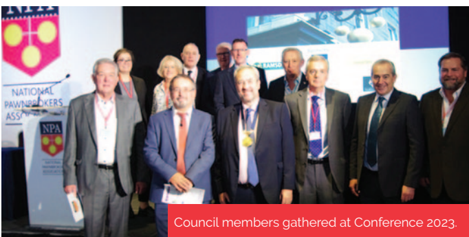
Council members gathered at Conference 2023.

Not only will you be hearing from leading professionals in their sectors of expertise, but just as importantly, you will be able to network with other members facing similar challenges and also be able to speak to members from the larger corporate entities. Following each presentation, and time permitting, there will be an opportunity for questions. Or, if you prefer, presenters will be freely available, for you to talk to during the breaks in the exhibition area. Let's all make this conference successful, and on behalf of the NPA Council, we look forward to seeing you all.